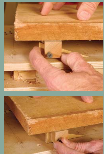
Adjust the support blocks. Slide the wedge until the block just touches the board. Then tighten the drywall screw by hand to lock the wedge in place.

Place the board on the sled. If it is cupped, rest it with the concave side facing down. Rock the board to locate high spots.