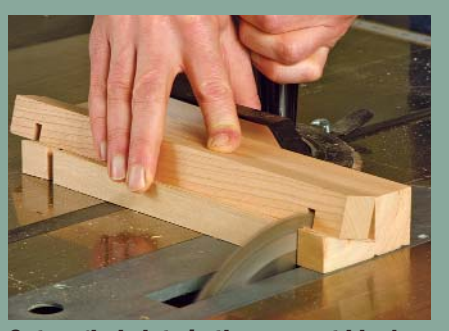
Cut angled slots in the support blocks. Use a sled angled at 15° to cut a slot in the underside of the support block.