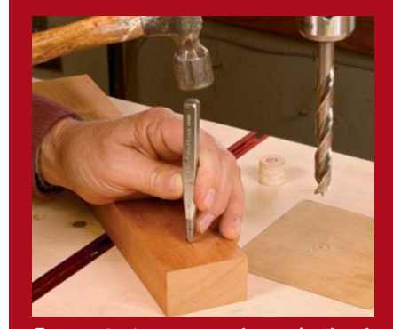
For greatest accuracy when using bradpoint and twist bits, use a center punch before drilling.

To accommodate various thicknesses of workpieces and various lengths and types of tools, you'll adjust the table quite often. Usually this means cranking the table up and down a gear rack on the support column, and locking it in place. Most tables also can be tilted for angled holes.