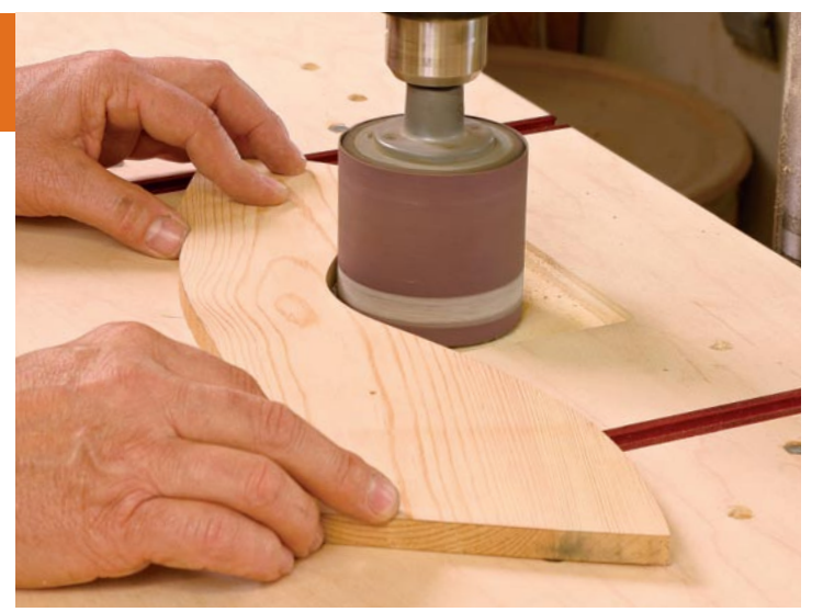
Sanding drums are good for curved work. The cutout in this table allows the drum to contact the workpiece properly.