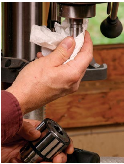
A wobbly chuck can be corrected. You'll need a dial indicator and some drill rod to test for runout. If you find more than 0.005 in. of wobble, use a deadblow hammer to knock the chuck free. Clean any gunk off the taper, and reinstall the chuck.