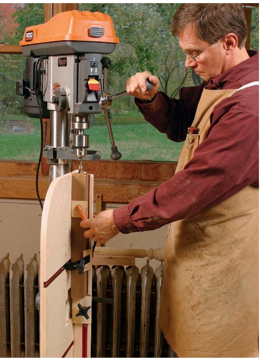
Tilt the table for end-grain and angled holes. To drill into the ends of long pieces, turn the table to 90° and use the auxiliary table's fence, stops, and hold-downs to secure the work (above). For angled holes such as through-mortises in the top of a stool (right), tilt the table and use the fence as a work stop.

creating a reverse screw action. This causes the work to climb the drill bit until something stops it. If the workpiece clears the stop or fence, climb quickly can lead to spin. The cure is to clamp the piece to the tabletop. I prefer to use a small toggle clamp mounted to the T-tracks in my auxiliary table. I also use these clamps on special drilling jigs that I make for repetitive tasks. They can be mounted on tall wood blocks for clamping thicker or taller items.