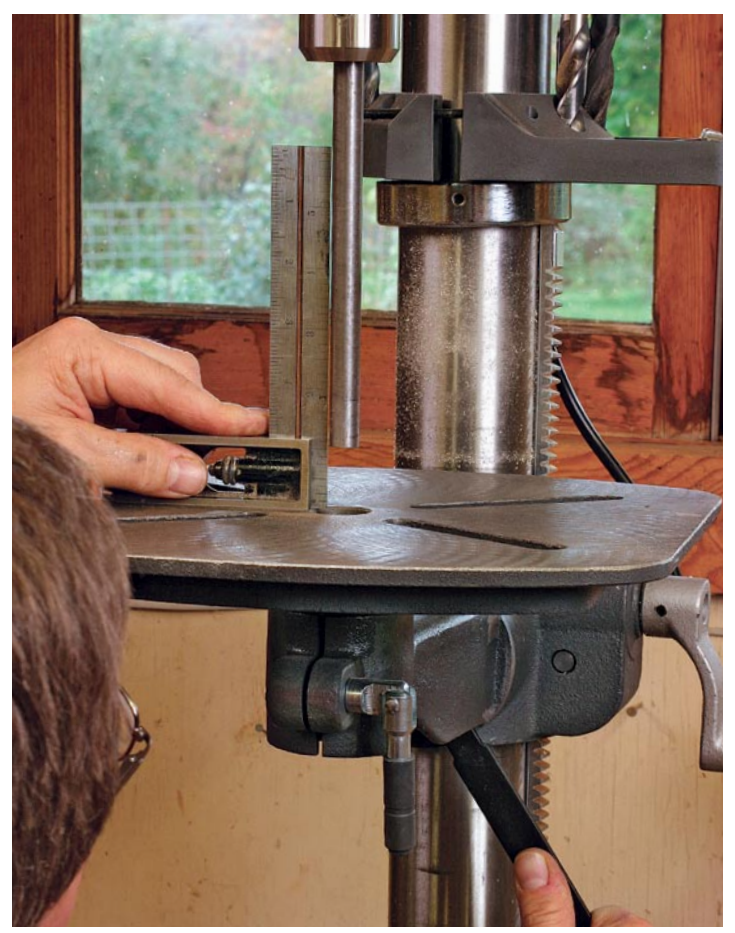
Squareness is a must. Again, the piece of drill rod is helpful. Drill-press tables include a side-to-side adjustment. If the table isn't square from front to back, you'll have to shim the auxiliary table (see drawings, p. 62).