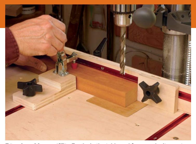
T-tracks add versatility. Tracks in the table and fence make it easy to secure the fence, end stop, and various hold-downs.

Drill-bit climb is another danger. This occurs as a large bit breaks through the back surface of the wood and jams in the hole,