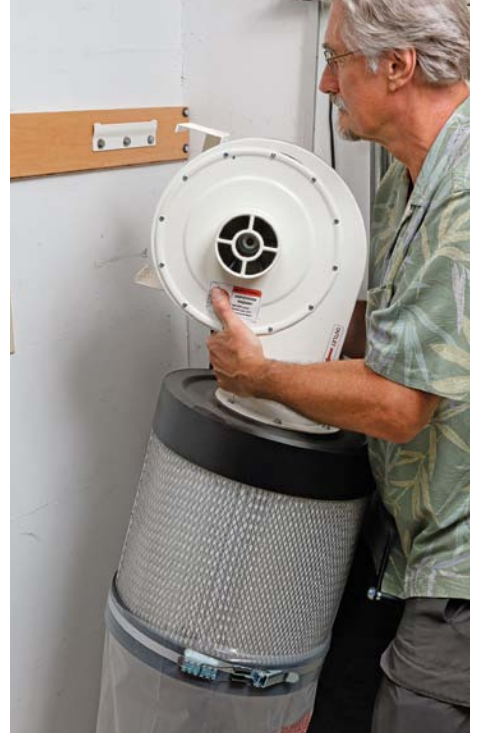
When floor space is tight. Though it can weigh about 65 lb., a wall-mounted dust collector can be moved quickly (it just hangs on a bracket) and stored elsewhere if needed. Get an extra wall bracket or two and move it around the shop where it's needed.

For this article, I tried two 1-hp dust collectors that would fit my small space: a mobile tool (General International model No. 10-030CF M1) and a wall-mounted