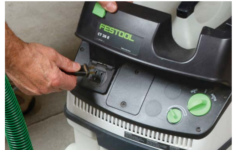
From a workhorse basic to bells and whistles. While a sturdy, no-frills model is great to have, a handy feature on higher-priced vacs is the autostart function. When a power tool plugged into the vacuum is turned on, the vacuum starts automatically.

Narrow hose works better. The 2<sup>1</sup>/2-in.-dia. hose that comes with a typical shop vacuum is too large in diameter for easy hookup, plus they are stiff and bulky. Invest in a smaller-diameter hose, which allows for easier hookup and more freedom of movement.